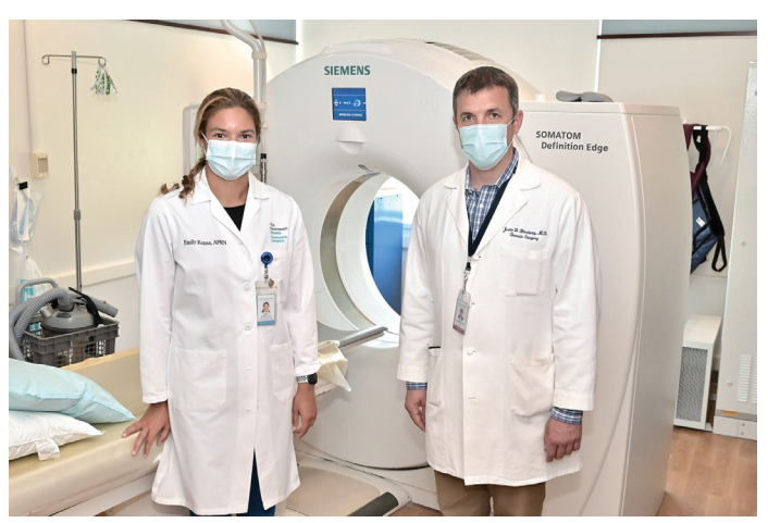
The Smilow Cancer Hospital Care Center in Greenwich uses low-dose CT scans to screen at-risk individuals for lung cancer.