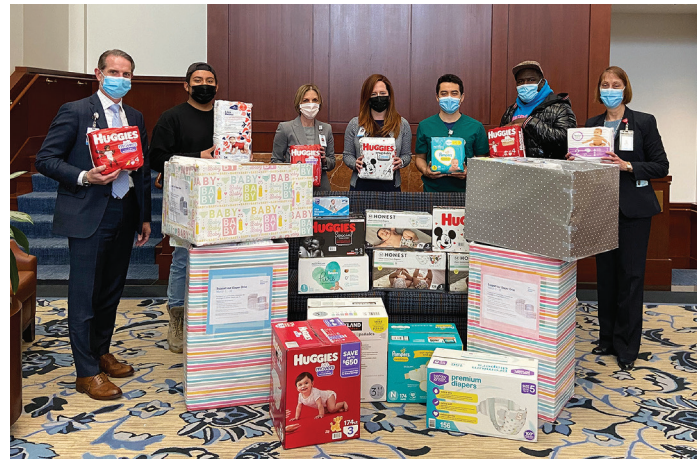
Medical staff and employees donated 3,240 diapers to social agencies in Greenwich and Port Chester, NY, as part of a statewide Yale New Haven Health initiative.