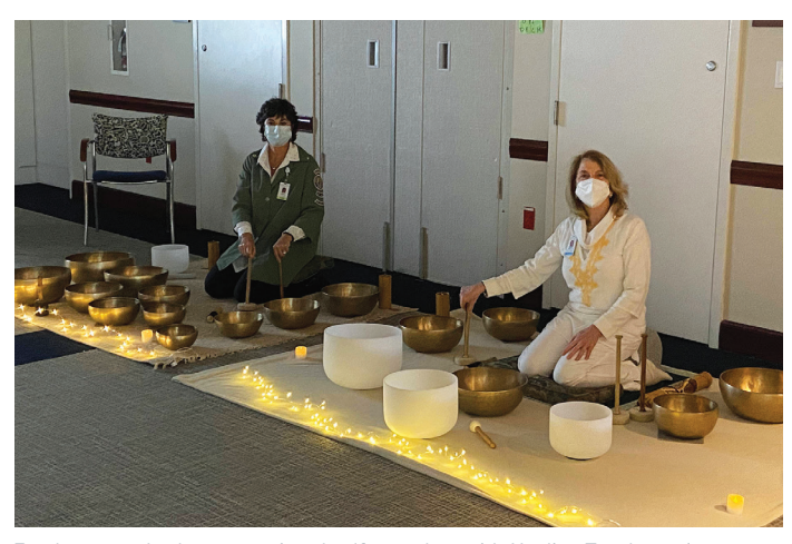
Employees and volunteers enjoyed self-care days with Healing Touch sessions, meditation, and Sound Healing with Tibetan and crystal bowls.