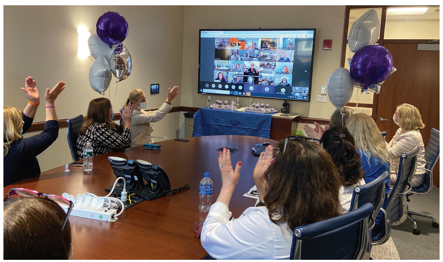
Greenwich Hospital nurses cheered upon learning that Yale New Haven Health's Nurse Residency Program had been recognized by the American Nurses Credentialing Center.

Helping employees to attain life-work balance was a top priority. Greenwich Hospital established Easy Care, an onsite health clinic for employees, and Self-Care Days for employees, which offered meditation. A pilot program focusing on spirituality and nursing promoted staff well-being and improved retention, while enhancing patient care. Clinical nurse transition coaches supported graduating nurses as they assumed their professional roles.