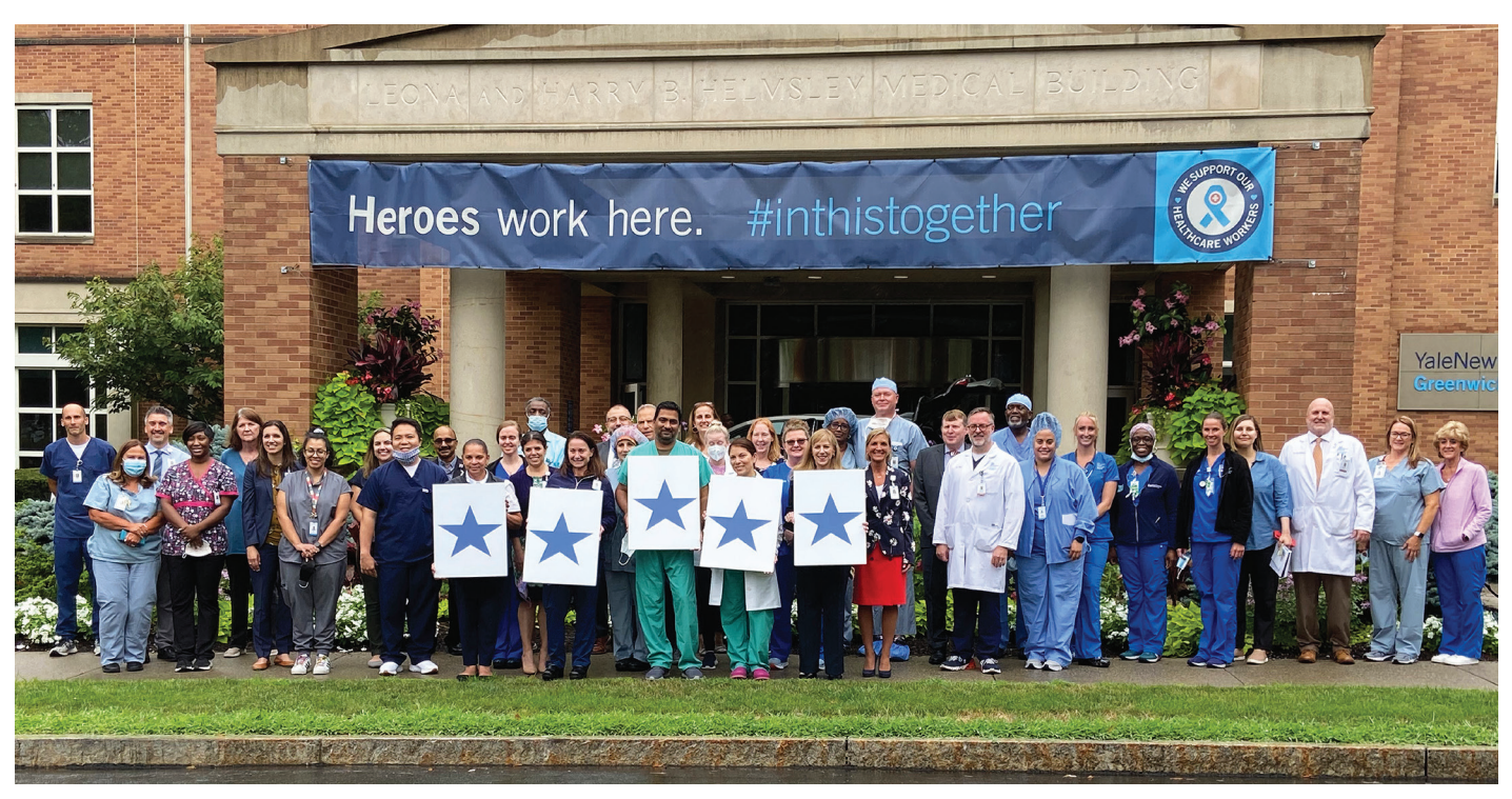
Physicians, nurses and staff celebrated as Greenwich Hospital earned a five-star hospital quality rating from the Centers for Medicare and Medicaid Services