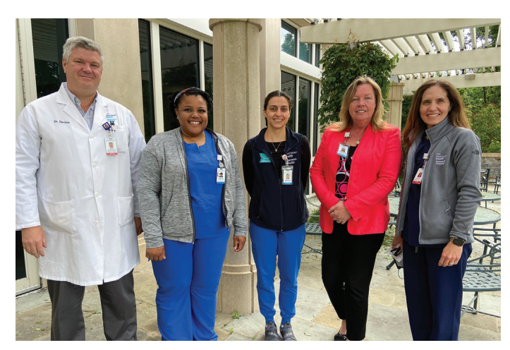
Emergency Department leaders were behind the effort that led to Greenwich Hospital's national certification as a Level III Geriatric Emergency Department.

The Smilow Cancer Hospital Care Center in Greenwich provided innovative lung cancer screening with low-dose CT scans to potentially increase survival rates. Several Yale Cancer Center physicians joined the Smilow team in Greenwich, further expanding the scope of surgical, medical and radiation oncology services available to area patients.